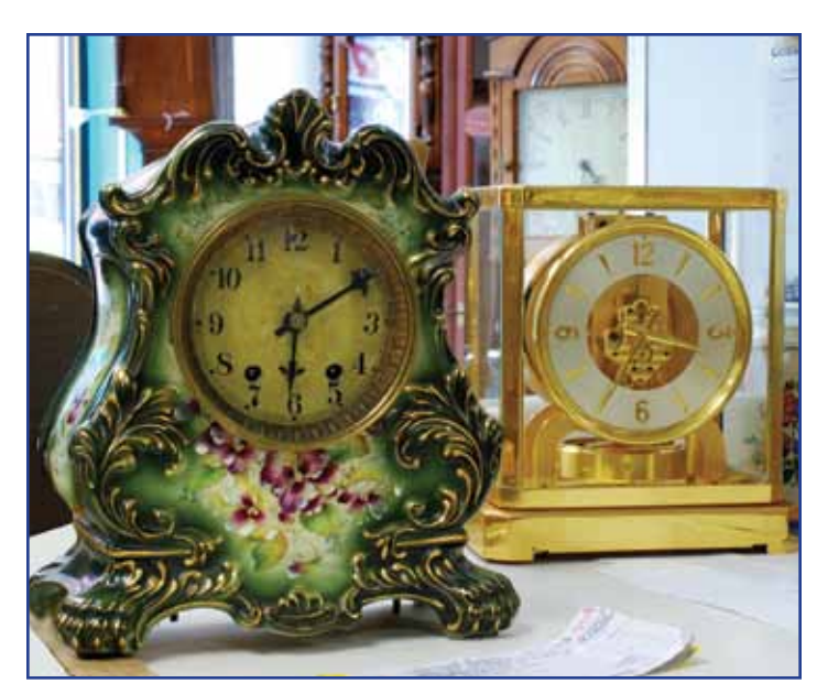
From delicate antique china clocks to high-end Atmos clocks, Blackstone Manor sees all types of repair challenges.

The student's initial pocket watch project (for which he, of course, needed much assistance), has developed into additional practice projects on cuckoo clock and grandmother-sized movements.